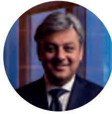
Luca de Meo, Chairman of the Executive Committee of SEAT