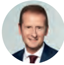
Dr. Herbert Diess, Chairman of the Board of Directors of SEAT